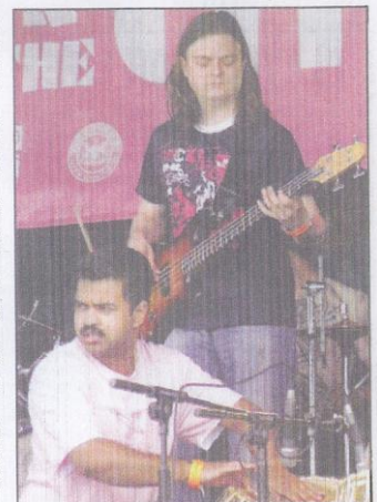
Musicians from the Motion Project will be at the Arts Centre.

Separate tickets for the workshops and the Motion Project performance are £5 each, while a combined ticket for the two is £8.